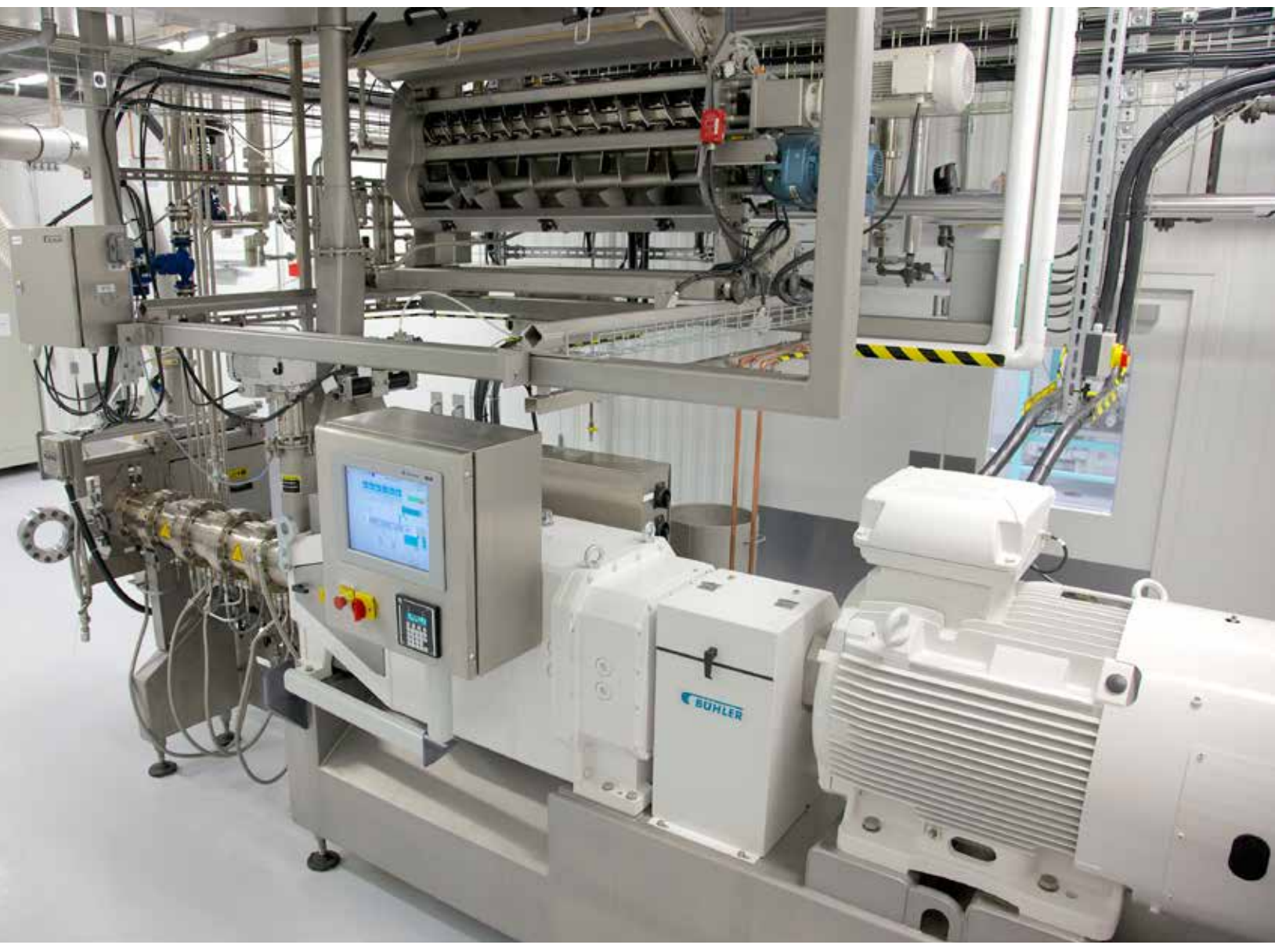
Preconditioning and Extrusion Room.

Weighing, dosing, heating, mixing, cooking and kneading.