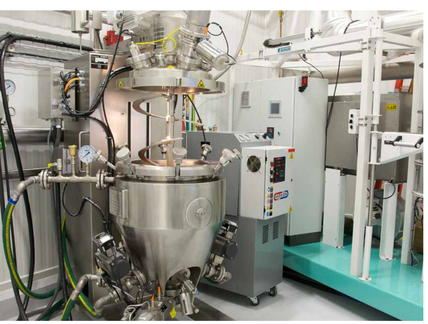
Controlled Condensation Process CCP.