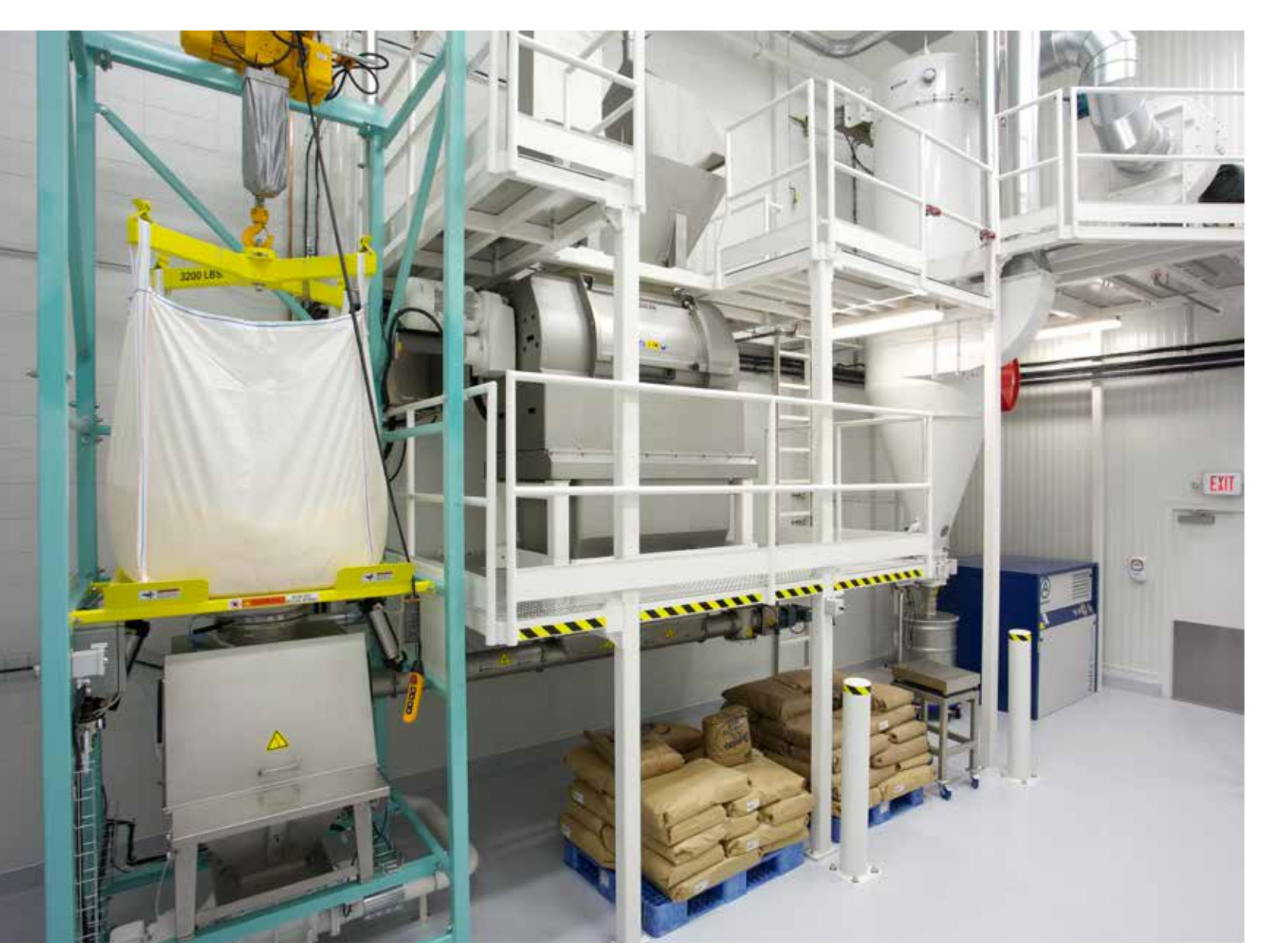
Food Innovation Center Raw Material Intake Room.