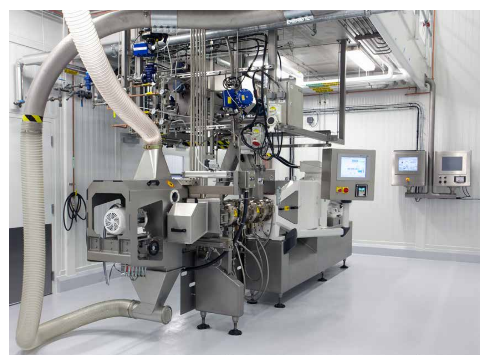
Bühler POLYtwin™ Twin-Screw Extruder with Machine Control.