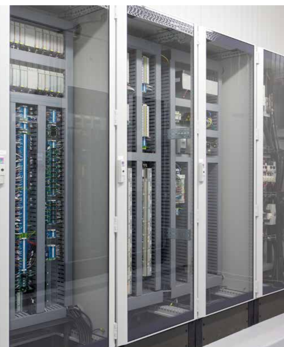
Equipment Control Center.